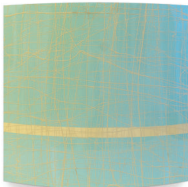
Green with Yellow Stripe / Pastels I, 2014, 60 x 60 cm

With deep insight and drive, Rashid Al Khalifa continues to draw inspiration from his origins but always goes one step further with his inventiveness and design of thought provoking and awe inspiring aluminium structures.