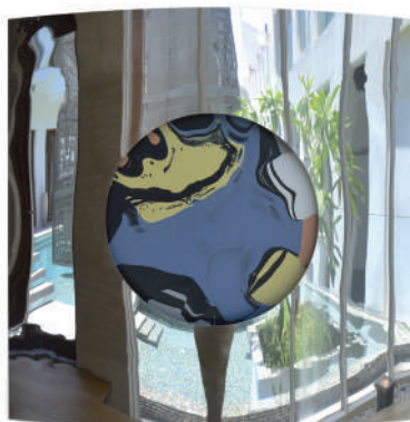
Seeing, 2014, Enamel on Aluminum, 120 x 120 cm

Metamorphosis Art Projects and Naif Gallery have carefully selected works from Rashid Al Khalifa's Hybrid, Parametric and Spectrum series, including one of his Mobile Columns, on display in the Atrium of the Scope pavilion, as part of the 'New Contemporary' multidisciplinary program. It is from the series of Mobile Columns, that in 2018, Rashid began to develop structures formed of complex, grid-like patterns, characteristic of much of his later work. When viewed from certain distances and at certain angles, moiré patterns begin to appear, and our mind endeavours to comprehend these subtly shifting inventions, as the artists explores the limits of our perception. Rashid's art is experiential and participatory, whereby his choice of materials and meticulous design, purposefully combines exuberant colours and gradations of shadow.