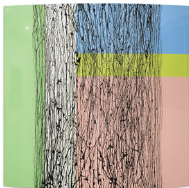
California, 2011, Enamel on Aluminium, 190 x 190 cm

Rashid Al Khalifa's steady artistic development over the past forty years, was largely influenced by the mystery and constantly shifting the landscape of his native Bahrain. Furthermore, he found inspiration in the repetitive nature of Islamic architectural patterns, that presented him with an opportunity for precise observation of light and shadow, and the consideration of positive and negative space. Interestingly, despite the transformation of his style and use of material, the interplay of light and shadow and Rashid's sensitivity towards form, femininity and colour, continues to characterize his work.