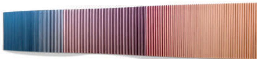
Spectrum VIII, 150 x 450 cm (59.05 x 177.16 in) Enamel on Aluminium, 2021 (Side View)

MIAMI BEACH 2021 | NOVEMBER 30 - DECEMBER 5 Booth F05